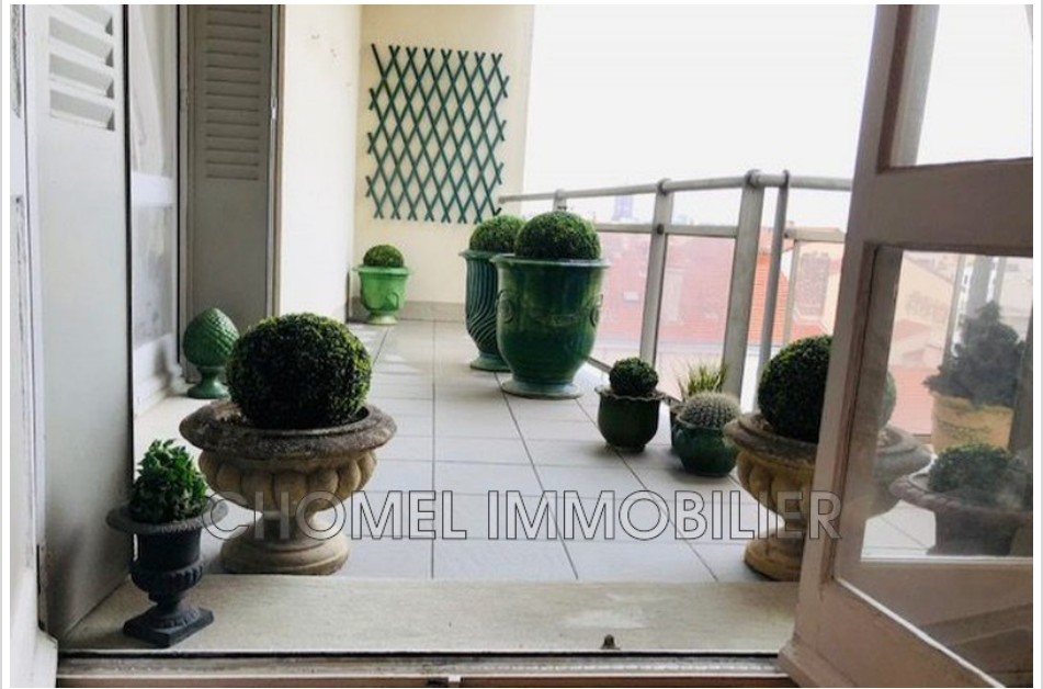
Apartment ref. 603V136A Lyon

CHOMEL IMMOBILIER offers you for sale this very large Type 4 apartment, possibility 3 bedrooms, located on a high floor in a well-maintained building dating from 1950 located avenue Berthelot. In addition to a large entrance hall, an equipped kitchen, and 2 bedrooms; it currently offers a double living room of 43 m 2 opening onto an east-facing living balcony (in which the kitchen can be moved). A garage is rented for 100 € / month if desired. Monthly charges including heating and cold water: 200 €, Land tax: 1000 € Ideally located in the heart of the popular district of Jean Macé, (metro station 5 minutes walk) and the Quai du Rhône. To see quickly